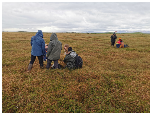
Fig. 7. Stangarholt oligotrophic fen.

We spent the whole day in the field. Our focus was on peatland sites. We saw the variability from a site that has lot of Sphagnum compared to sites that do not have that much. We also saw the difference between sites that have very little deposition from volcanic ash to sites that have a lot of volcanic influence.