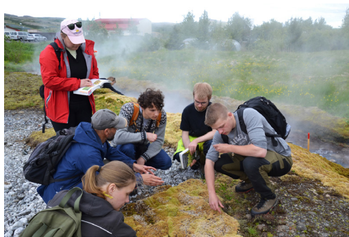
Fig. 6. Studying Sphagnum along hot springs in Kleppjárnreykjum, some 25 km north-east from Hvanneyri.

Accommodation of the day: student housing in Hvanneyri