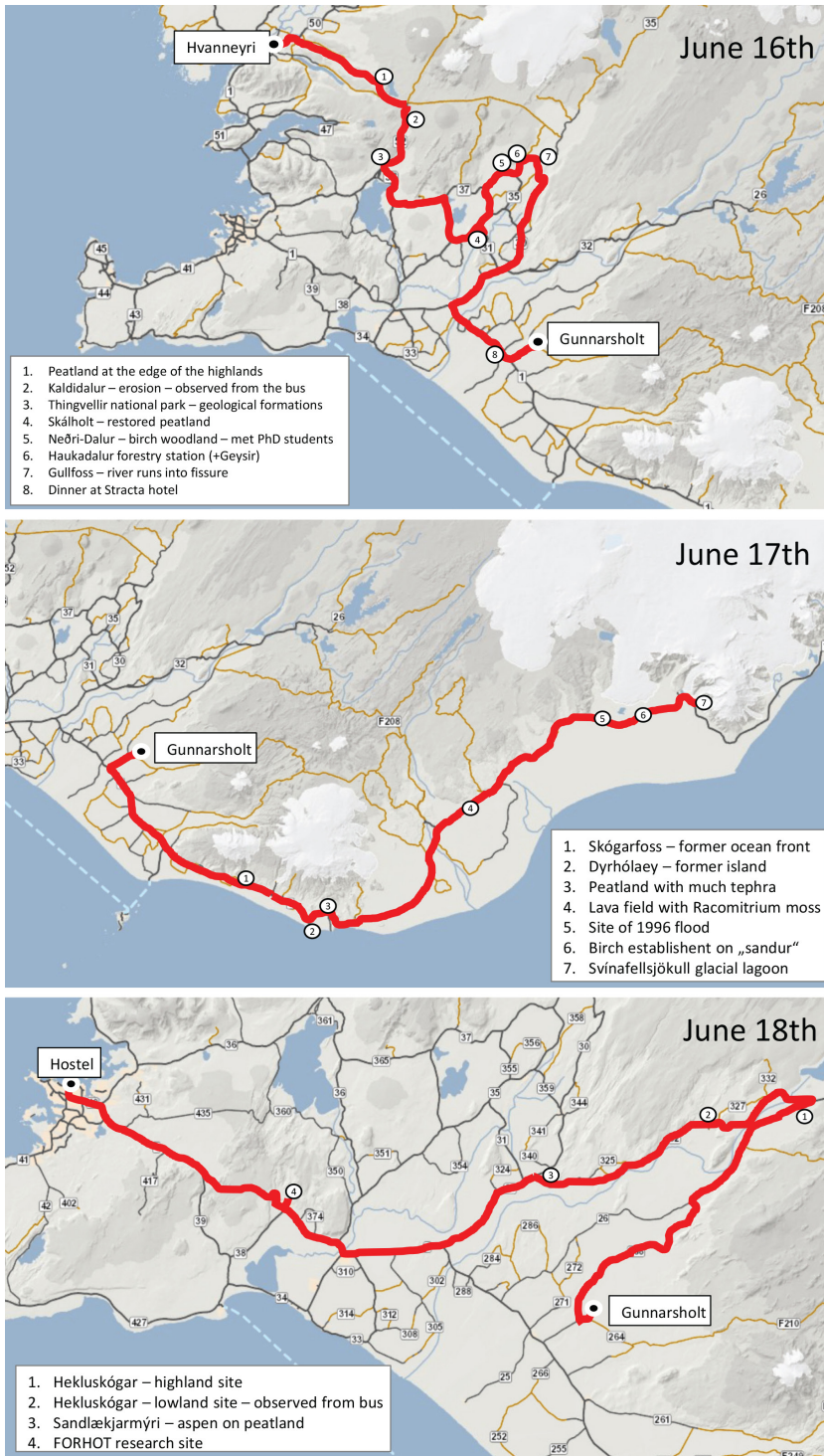
Fig. 10. Maps and travel itinerary of the plant biogeography part of the course (Images: Hlynur Oskarsson).

Kuva 10. Kurssin kasvimaantieteellisen osan kohteet kartalla.