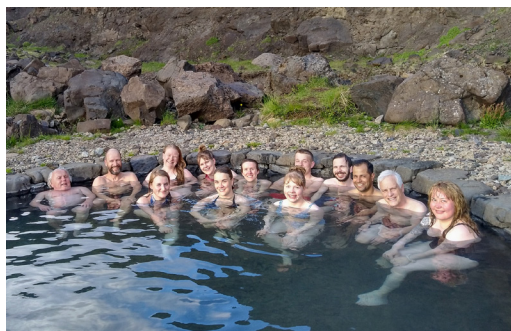
Fig. 4. One of the highlights of the course were the hot spring spas. Here the Húsafell spa in the middle of mountains.

One special thing about the meaning of Sphagnum in local languages, Finnish, and Icelandic, is worth mentioning here. In most languages, Sphagnum is translated as "peat moss". This is