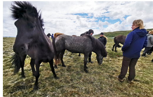
Fig. 3. Sometimes there were more horses than students attending the course.

of Iceland is situated (Fig. 1). The course included lectures inside and outside (Fig. 2) as well as laboratory work. During excursions we were acquainted with many research projects and even local animals (Fig. 3).