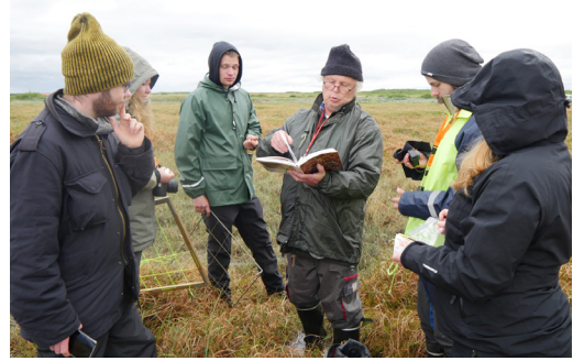
Fig. 2. Field lecturing by HV during the Sphagnum course. Each participant received his/her own copy of European Sphagnum mosses guide (Laine et al. 2018), which was the main reading material during the course.

The first overnights, lessons and microscopic analyses were in Hvanneyri where the main campus of the Agricultural University of Iceland is situated. The base camp during the biogeography field excursion was in Gunnarsholt where the Headquarters of the Soil Conservation Service